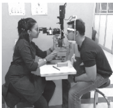
The real identities of the patient has been changed for reasons of medical ethics and privacy.