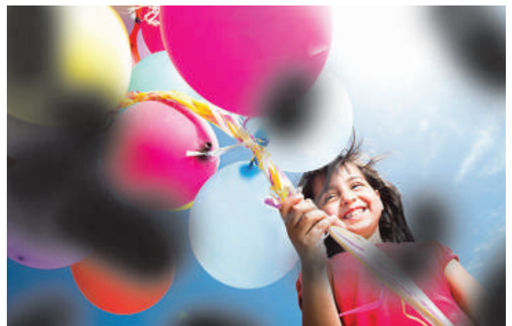
DIABETIC RETINOPATHY - BLURRED VISION